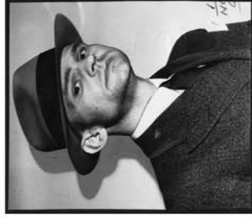
Special Agent in Charge of the Chicago Field Office, Melvin Purvis

The story of the modernization of the FBI is incomplete. There were a multitude of factors other than the crimes of John Dillinger, which were equally important to allowing the FBI to branch out in jurisdiction. The New Deal was causing people to confront their ideas of how the government was supposed to function in society. State and Local Law Enforcement were unable to catch John Dillinger and the new breed of criminals. Finally, Hoover was using the media to glorify his agency, while vilifying Dillinger. A variety of sources were used to come to this conclusion. Newspaper articles, speeches from President Roosevelt, the FBI files themselves, and film clips all give a different picture as to what happened here.