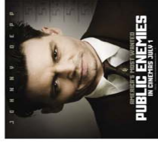
John Dillinger and the Media

On top is a movie poster from the 1945 film titled Dillinger . On the bottom is a movie poster from the 2009 film titled Public Enemies .