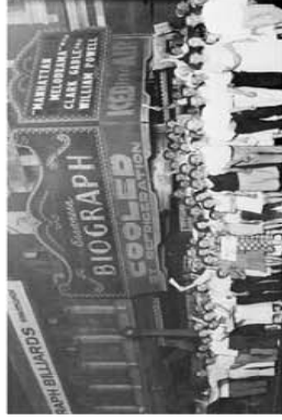
The Biograph Theater the night of John Dillinger's death.

Given the conservative atmosphere of the 1920's, it would have been folly to predict that the federal government would ever get involved in crime fighting.. With President Roosevelt wielding great popularity and the trust of the people, he was able to soothe the people's interests about the expanding government. John Dillinger's crimes were not shocking enough to create a revolution in government functions.