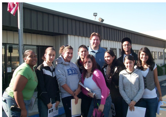
2007-2008 HHMI Mentees