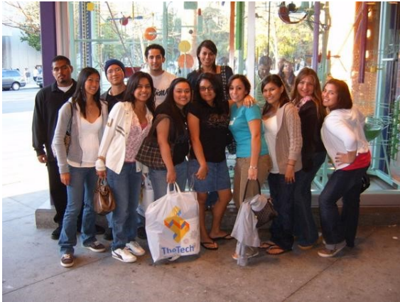
Body Worlds 2008