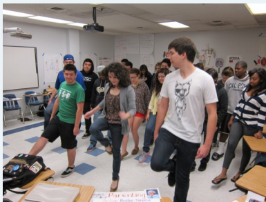
Success in Science class doing an interactive presentation