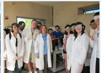
Mentees at the regenerative center learning about and making biodiesel