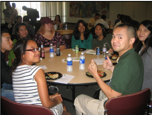
The CRSP tutors enjoy lunch together during this year's All Tutor Ceremony.

On June 6, the Learning Resource Center held an awards ceremony for some of its best tutors. The ceremony also recognized this year's graduating and CRLA-certified tutors. Several CRSP tutors were among those honored.