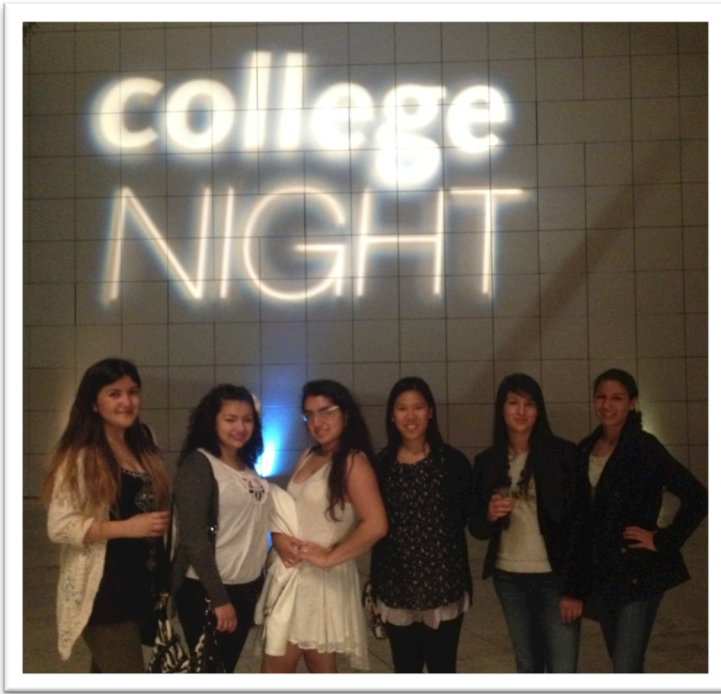
A sharp-looking group of program participants pose for a shot at the Getty Center.