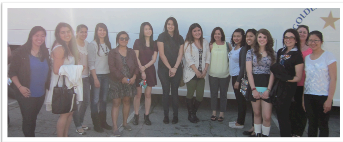
Students and staff attending College Night at the Getty Center pose near the shuttle bus before departing for a fun evening.