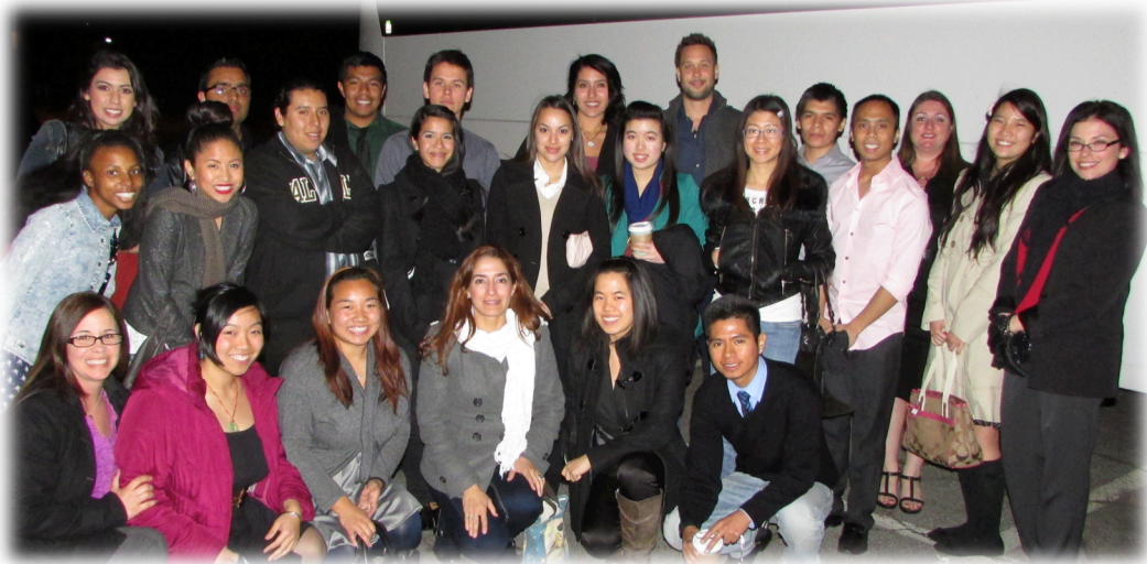
Jekyll and Hyde attendees gather before departing on the bus