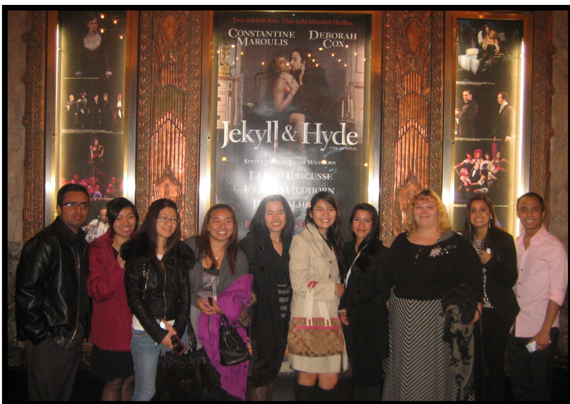
Participants and tutor-mentors pose outside the Pantages Theatre