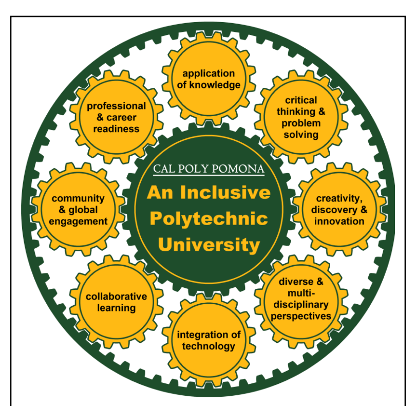
Figure 1. Elements of Cal Poly Pomona's inclusive polytechnic education

The eight elements shown in Figure 1 provide a framework for the inclusive polytechnic approach at Cal Poly Pomona. Collectively, these elements give powerful expression to the educational experience of our diverse students. Incorporation of these elements in all curricular and co-