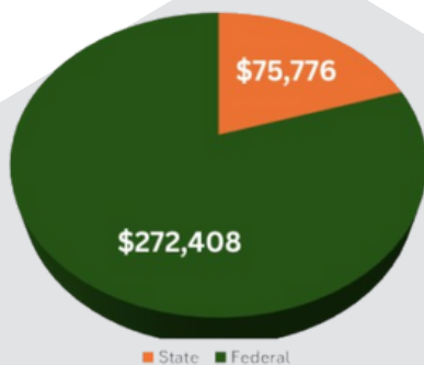
Total earned income tax credits

The pie charts illustrate the breakdown of Cal Poly's total tax refunds and total earned income tax credits by source: state and federal. These indicate that federal contributions make up the larger share of both tax refunds and earned income tax credits received.