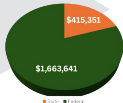
Total earned income tax credits