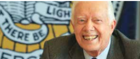
PRESIDENT JIMMY CARTER