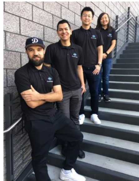
Last year's Cal Poly Global Supply Chain Challenge team

OMS students formed a total of 4 teams to compete in the Global Student Challenge! The Global Student Challenge is a worldwide competition where students must find solutions to complex supply chain issues. Last year, Cal Poly Pomona's team placed 4 th globally and had the opportunity to compete in The Netherlands! The current 4 teams have a 3 month period where they must qualify in order to move forward within the competition. Good luck to this year's participants!