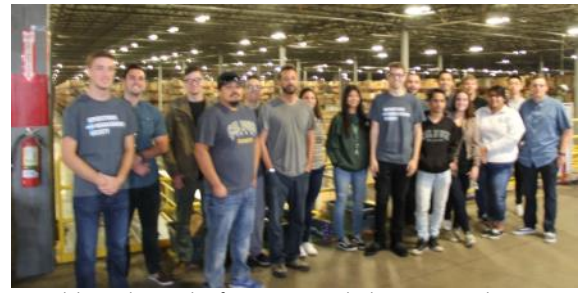
OMS Club members gather for a picture inside the Target Distribution Center