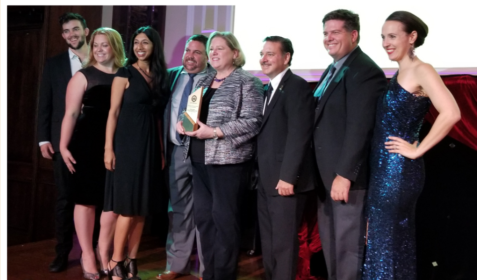
The building project team was honored at the 13th Annual Green Gala in November.