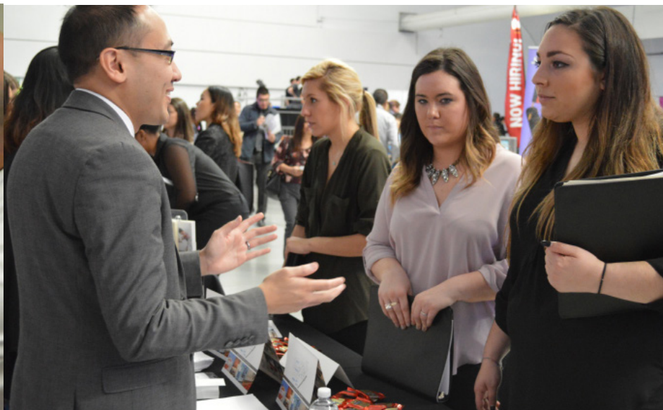
CSU students at the Northern California Career Fair at San Francisco State University.