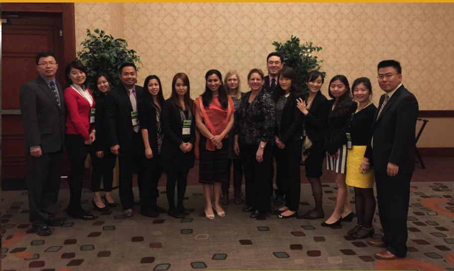
Left: Master's students at the Graduate Student Research Conference. Right: Faculty and student conference participation has grown this past year.