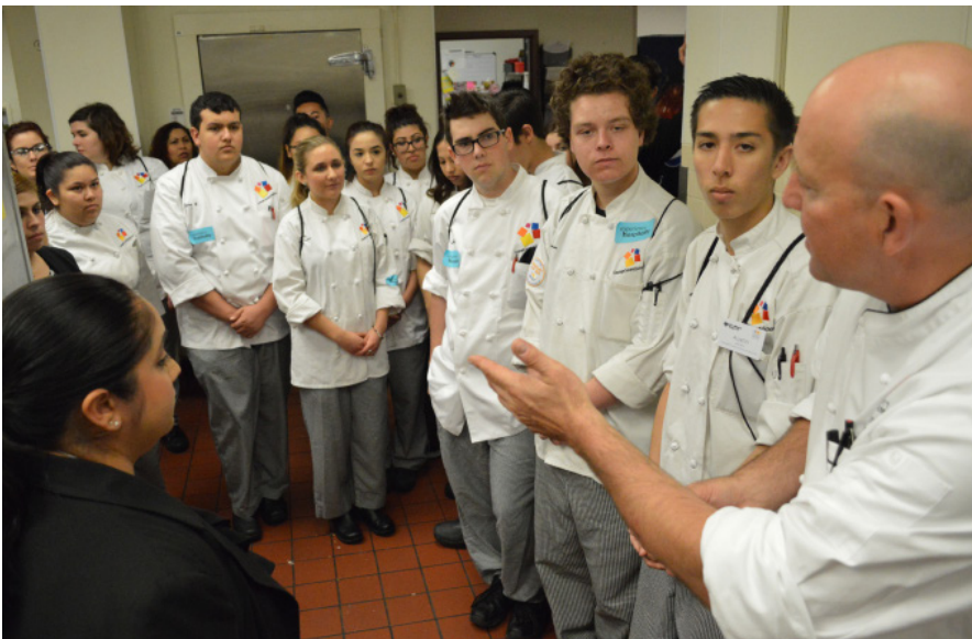
High school ProStart students tour the kitchens of the Anaheim Marriott.