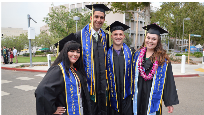
Collins Ambassadors before their commencement ceremony.