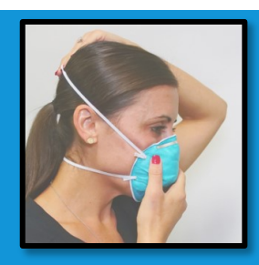
3. Pull the bottom strap over your head and place it around your neck, below your ears.