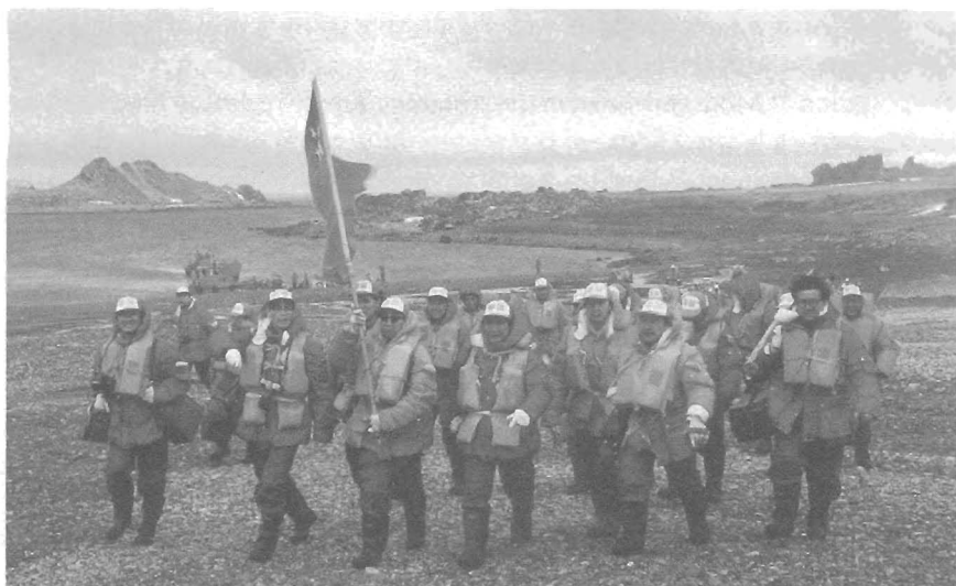
FIGURE 1. Chinese Antarctic expedition landing on King George Island, January 1984.

when expedition members bellowed out a new team song that praised “close comrades, loyal partners, we expedition members are good sons of China, good sons of China.” 41 Upon their insistence, and with Wu Heng’s approval, eight members of the expedition stayed behind at the Great Wall for the austral winter, apparently a rare feat during the first year of any station. 42