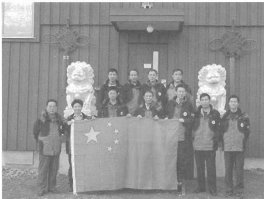
FIGURE 4. The opening ceremony of China's Yellow River Arctic station at Svalbard, Norway, 2004. From: http://tech.sina.com.cn/other/2004-07-28/1535394522.shtml .

number of journalists (about twenty) from many media outlets on board to report back to their vast audience anxiously tracking the progress of the expedition. 92