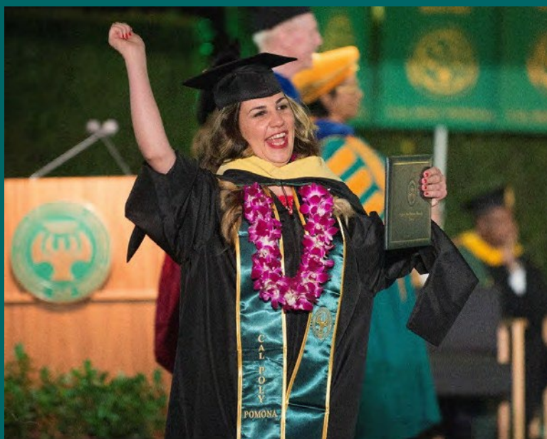
A master's student in agriculture at the College of Agriculture Commencement ceremony.

https://www.cpp.edu/studentsuccess/oss/academic-advising/university-policy-information/retroactive-withdrawal.shtml . For more information, refer to the Retroactive Withdrawal section under Academic Policies .