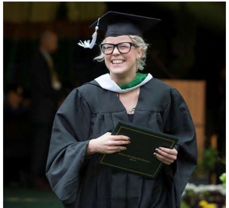
A master's student in English at the College of Letters, Arts, and Social Sciences Commencement ceremony.

To find contact information for your graduate program coordinator, visit: https://www.cpp.edu/gradstudies/graduate-coordinators.shtml