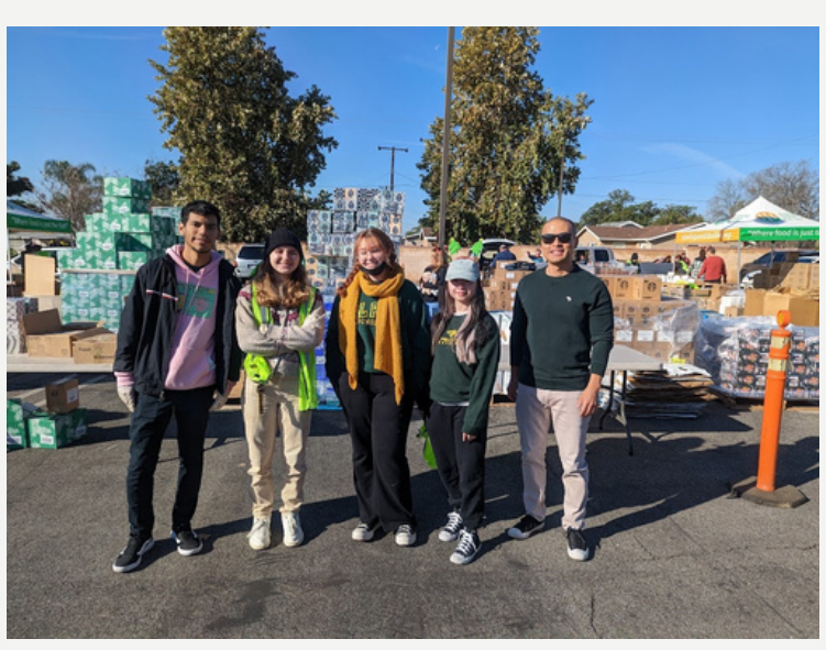
Fall 2022 Civic Engagement, Sowing Seads for Life