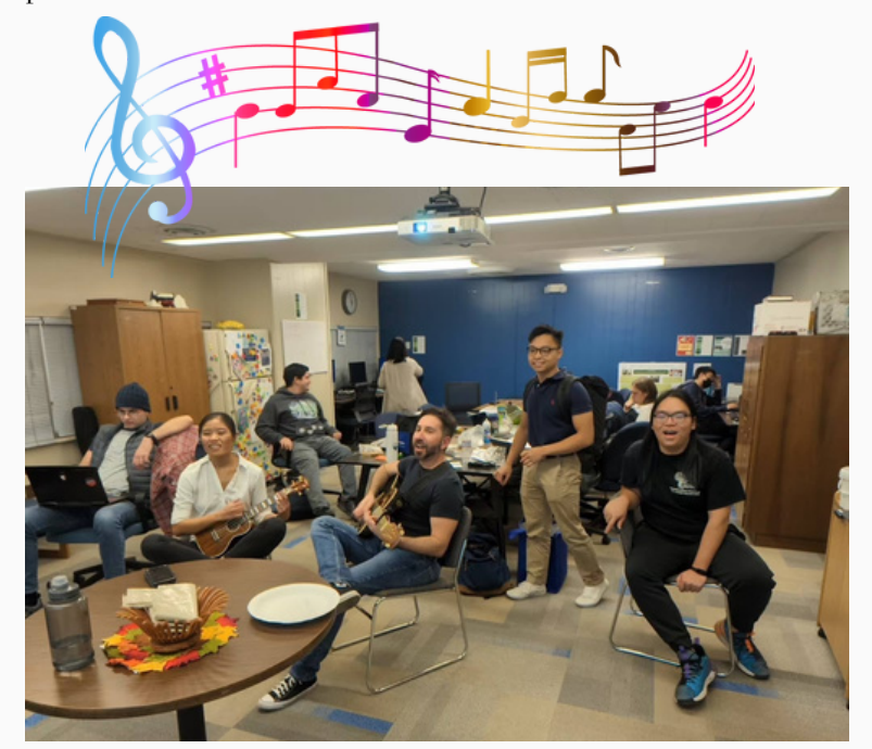
Musical Mondays in the KHC Commons, Fall 2022