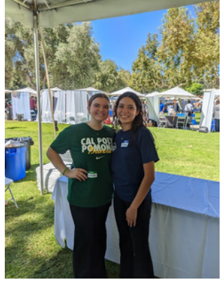
KHC students look for jobs and volunteer at the Fall 2022 Career Fair