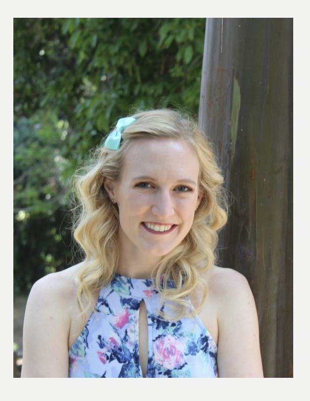
Click on the skates to learn more about Artistic Roller Figure Skating