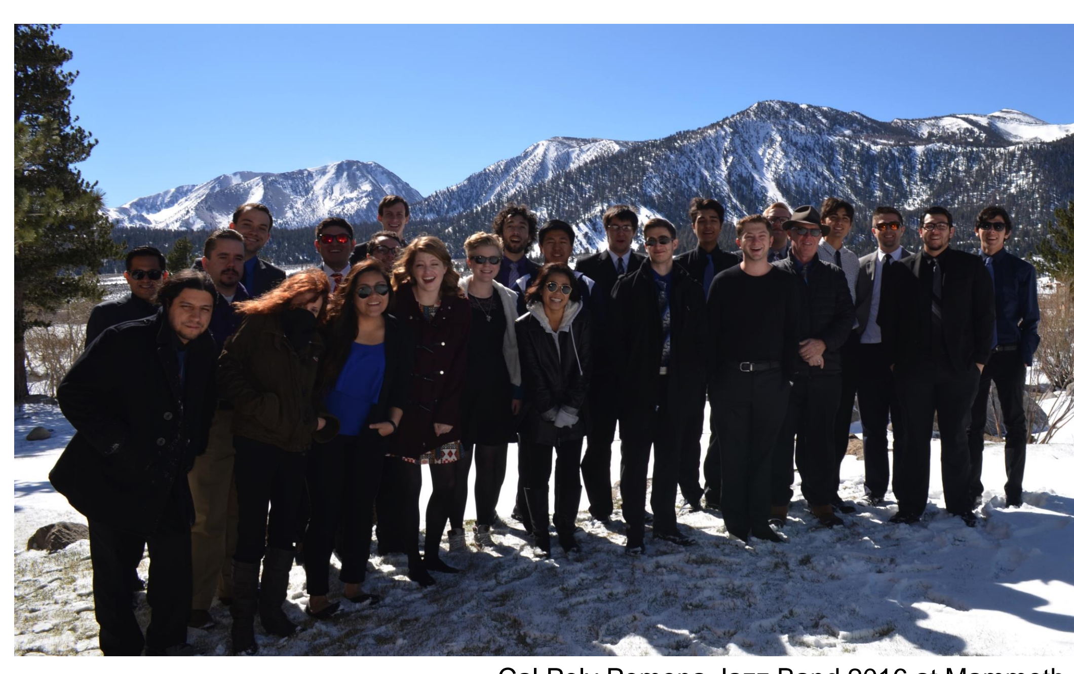
Cal Poly Pomona Jazz Band 2016 at Mammoth

In regards to rental cars, there are 30 of us, so one 15 passenger van and three mini vans. That leaves six empty seats (one whole mini van) to put all rental gear in. It will be a tight fit. We have five 25+ members who will be able to drive those vans.