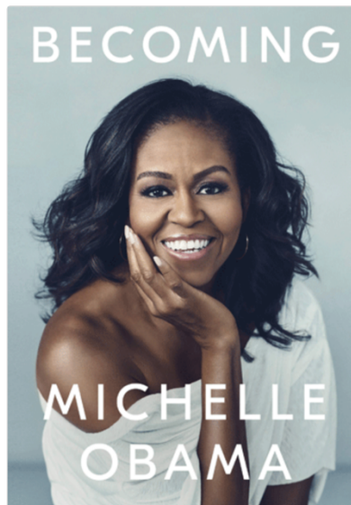
2019 FYE Challenge