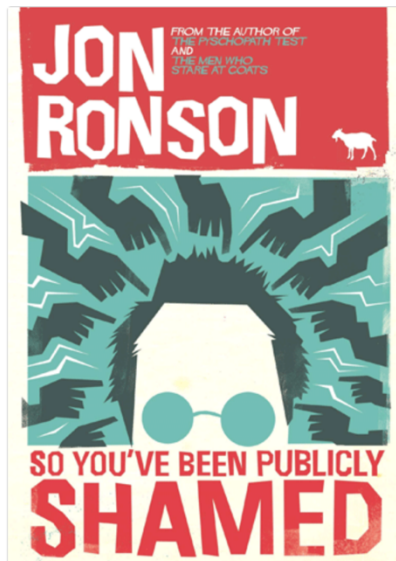
2018 FYE Challenge