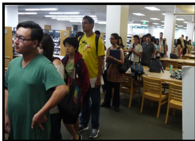
You would think we were giving away free Orange Juliuses, but in fact these students are in line to attend the Welcome Back/Orientation event!