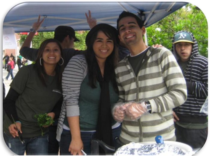
Members of CRSC engaged in the sale of delicious tacos in order to raise money for club activities.

Other fun events included attending the God of Carnage play at the Ahmanson Theatre with program participants and a successful taco sale (in the rain!) on May 17. The club was also able to present CRSP's graduates with a special gift at the Graduate Recognition Luncheon. All events went well and the club closed out the year with a ice skating party! If you are interested in becoming a part of CRSC, please email the E-board at: crsc.calpolypomona@gmail.com .