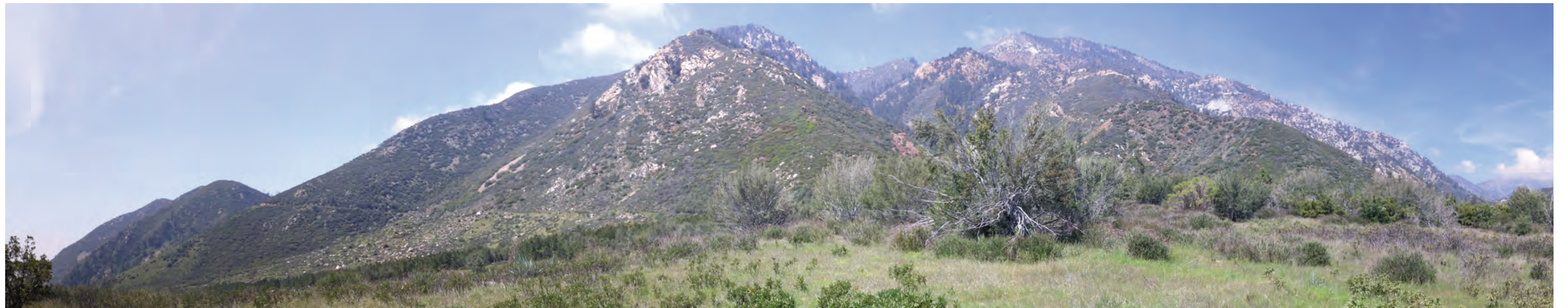
Cross section above, and roughly the same area photographed below showing Ontario Ridge metasediments with a potential large-scale fold projected upwards. For legend, see Plate I. Dotted lines indicate uncertainty. No vertical exaggeration.