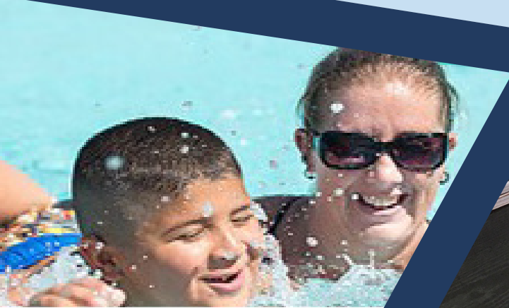
8 Helping students from the community practice swimming at the BRIC pool during the Motor Development Clinic Summer Program.

KHP is a destination department for innovators, educators and scientists in health and human movement.