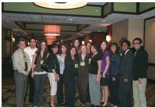
2008-2009 HHMI Mentees