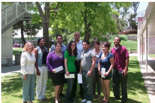
2009 Boeing Company Scholarship