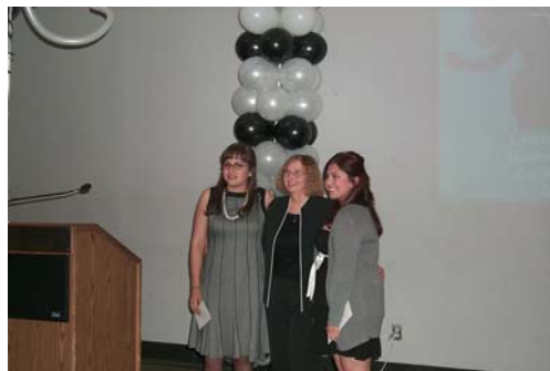
Paul C. Heimenz Scholarship