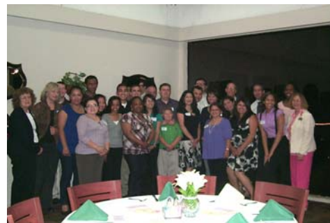
Alumni Dinner 2009

faculty (usually SEES advisors). Faculty also shared their own stories about SEES students. It was a very special evening of reminiscing about the great impact SEES had on both students and faculty. Thank you to all who attended. SEES would also like to thank the alumni for all of the donations received. These funds are used to help SEES students whose needs do not fit into the ordinary funding categories available to the SEES program, they are much appreciated!