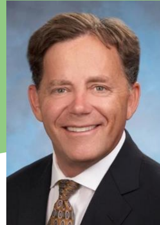
Sen. Josh Newman (SD-29)