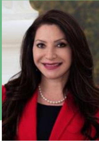
Sen. Susan Rubio (SD-22)