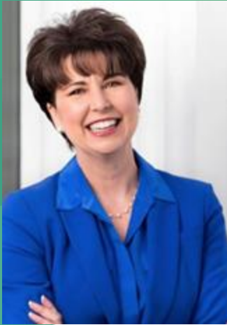
Sen. Connie Leyva (SD-20)