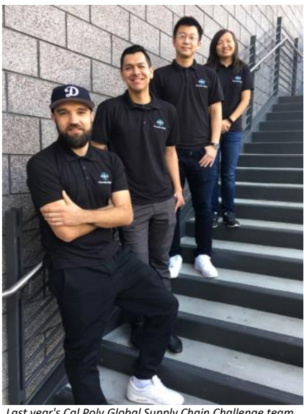
Last year's Cal Poly Global Supply Chain Challenge team

OMS students formed a total of 4 teams to compete in the Global Student Challenge! The Global Student Challenge is a worldwide competition where students must find solutions to complex supply chain issues. Last year, Cal Poly Pomona's team placed 4th globally and had the opportunity to compete in The Netherlands! The current 4 teams have a 3 month period where they must qualify in order to move forward within the competition. Good luck to this year's participants!