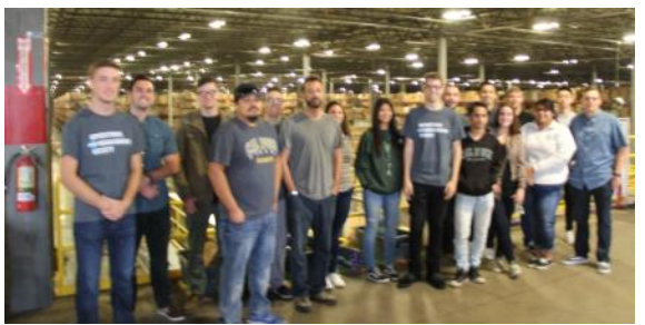
OMS Club members gather for a picture inside the Target Distribution Center