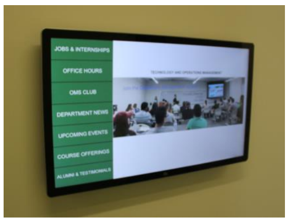
A preview of the interactive board's interface. (Located at 164-1030)

Do you have a quick question such as: office hours, upcoming events, or about new opportunities? The interactive board is your answer! The interactive board is located right outside the TOM department and it allows you to easily access information about our department, events, and even current jobs and internships!