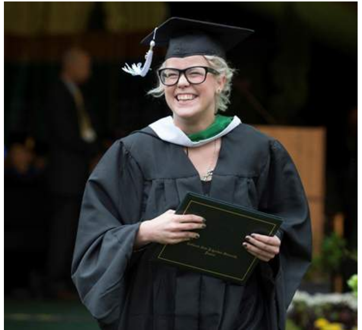
A master's student in English at the College of Letters, Arts, and Social Sciences Commencement ceremony.

To find contact information for your graduate program coordinator, visit https://www.cpp.edu/~gradstudies/graduate-coordinators.shtml