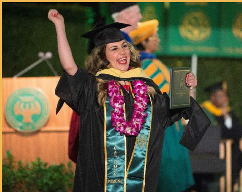
A master's student in agriculture at the College of Agriculture Commencement ceremony.

For more information, refer to the Retroactive Withdrawal section under Academic Policies.