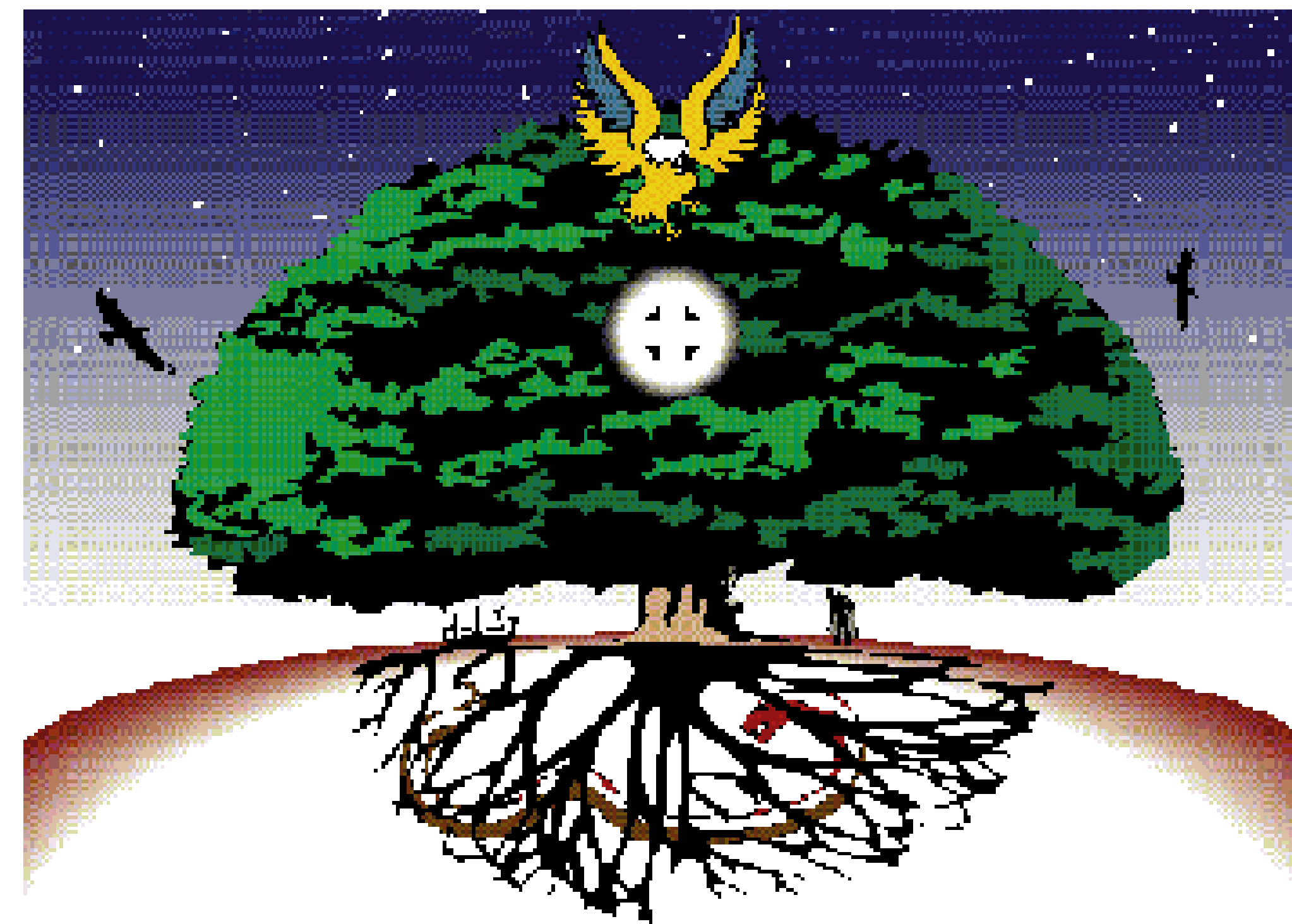
(Asatru) World Tree Publications Logo

The many religions that fall under the umbrella of Neopaganism in America are normally practiced individually or in small groups. Those ancient religions that have been reconstructed to be practiced in modern times— such as Nordic paganism (also Asatru), Egyptian religion, or Kemetism, and ancient Greek religion, or Hellenism— also follow this practice. Certain official organizations have memberships online, though they do not meet regularly. Small, local groups may meet on occasion, for specific holidays or rituals, but for such things as daily prayers and/or rituals, practitioners are on their own. In each of these religions, there are daily rituals which may be performed, such as caring for their god's shrine, leaving offerings, or meditation. A sense of community is needed for members of a shared religion, and online membership, supplemented with intermittent meetings between local members (if possible), accomplishes this. There may be weekly gatherings, as in church-Sundays in Christianity and Catholicism, but for the most part these religions are individualistic in nature. Many people follow these religions, but they are not as popular as Christianity. Hence the internet is an important source of information for those interested in their practices. People can sign up for classes about the religion, have their questions answered by an experienced follower, and receive support they are unable to get from their daily peers.