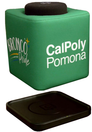
Wireless Charging Base