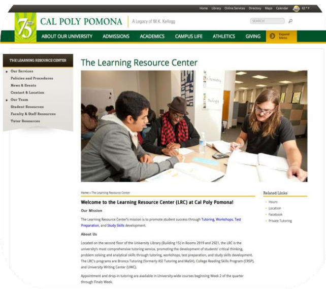
Pictured Above: Screen Cap of the LRC's new homepage

We have redesigned our website ! The new site matches the new Cal Poly homepage and other sites. With this new layout, it is now even easier to schedule appointments, download applications, register for workshops, find helpful study guides, and so much more. Visit the Our Services page to find the help you are looking for. Don't be left behind! Visit the News & Events page to see the exciting and upcoming events within the LRC. Students can access LRC, Campus, and Community resources in one place through our Student Resources page. Faculty can access tutor recommendation forms and workshops for use in their classroom in our Faculty & Staff Resources page.