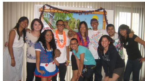
CRSP students and tutors at "Pumpkin Island" Peer Networking Meeting

Two "Financial Fitness" workshops were jointly hosted by CRSP and ARCHES on November 9 and 16 as part of a collaboration initiated last year. CRSP began providing students with workshops on financial aid and FAFSA several years ago, but has ramped up efforts to provide students with opportunities to develop financial literacy. The Higher Education Opportunity Act included new stipulations that TRIO Student Support Services programs, including CRSP and ARCHES, provide information on financial aid and financial literacy to all program participants. The two workshops offered fall quarter included information about credit, banking, budgeting, and fraud prevention. Joy Tafarella, of the Cal Poly Pomona Federal Credit Union, presented on November 9. She focused on budgeting for college students, using credit reports and credit scores, and avoiding scams. The CRSP staff presented on November 16 and focused on credit cards, banking, and fraud prevention.