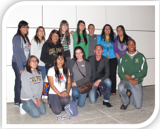
Group shot of ARCHES and CRSP students and staff at the Getty Museum