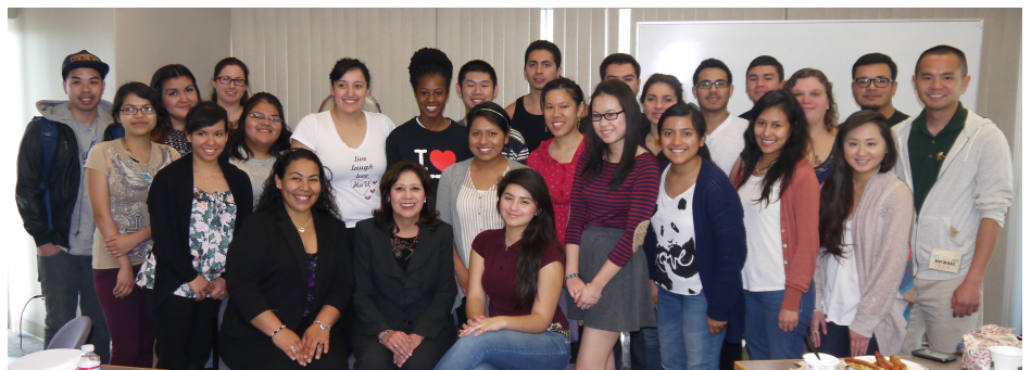
Professional Mentor, Secretary Hilda Solis ( left ); Solis with CRSP participants ( right )